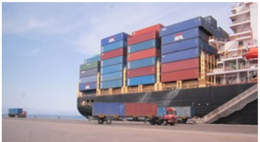
Port of Djibouti

The Head of Delegation of the ACSRT held high-level meetings with the Director General of the National Police of Djibouti and the Director General of the National Security Services. .