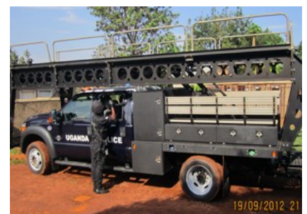
Counter terrorism Police