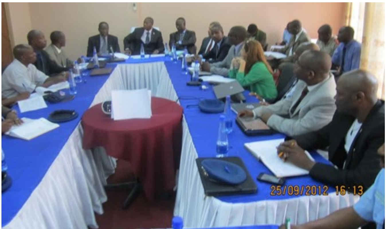
The Opening Session in Burundi

The ACSRT team also held a series of discussions with Ugandan, Burundian and Djiboutian authorities on counter-terrorism related matters, including radicalization and the de-radicalization, judicial cooperation in criminal matters, terrorism financing, law enforcement and border control. These discussions helped the team to assess threats arising as result from these countries' geographical positions, the rapid development of religious charities, the existence of networks in-