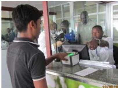
Entebbe International Airport