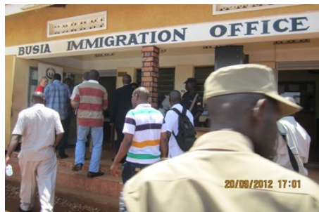
Busia Border Post

(CMI), the Director General of External Security Organization (ESO), the Deputy Director General Internal Security Organization (ISO), the Assistant Inspector General of Police in charge of Counter terrorism and the Director of the Joint Anti-Terrorism Task Force (JATT).